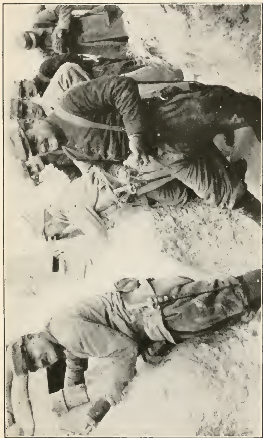
AMERICANS IN THE FOREIGN LEGION